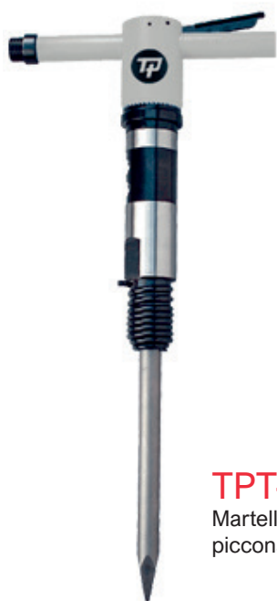
TPT-10S Martello picconatore