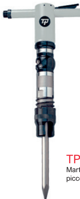
TPT-30S Martello picconatore